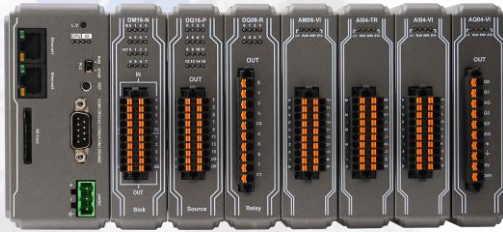
(I/O modules not included)